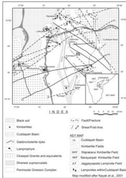
Geological Map of Wajrakarur Kimberlite Field